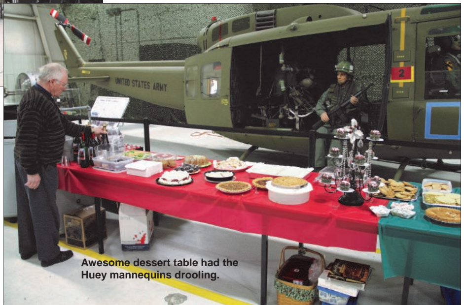
Awesome dessert table had the Huey mannequins drooling.