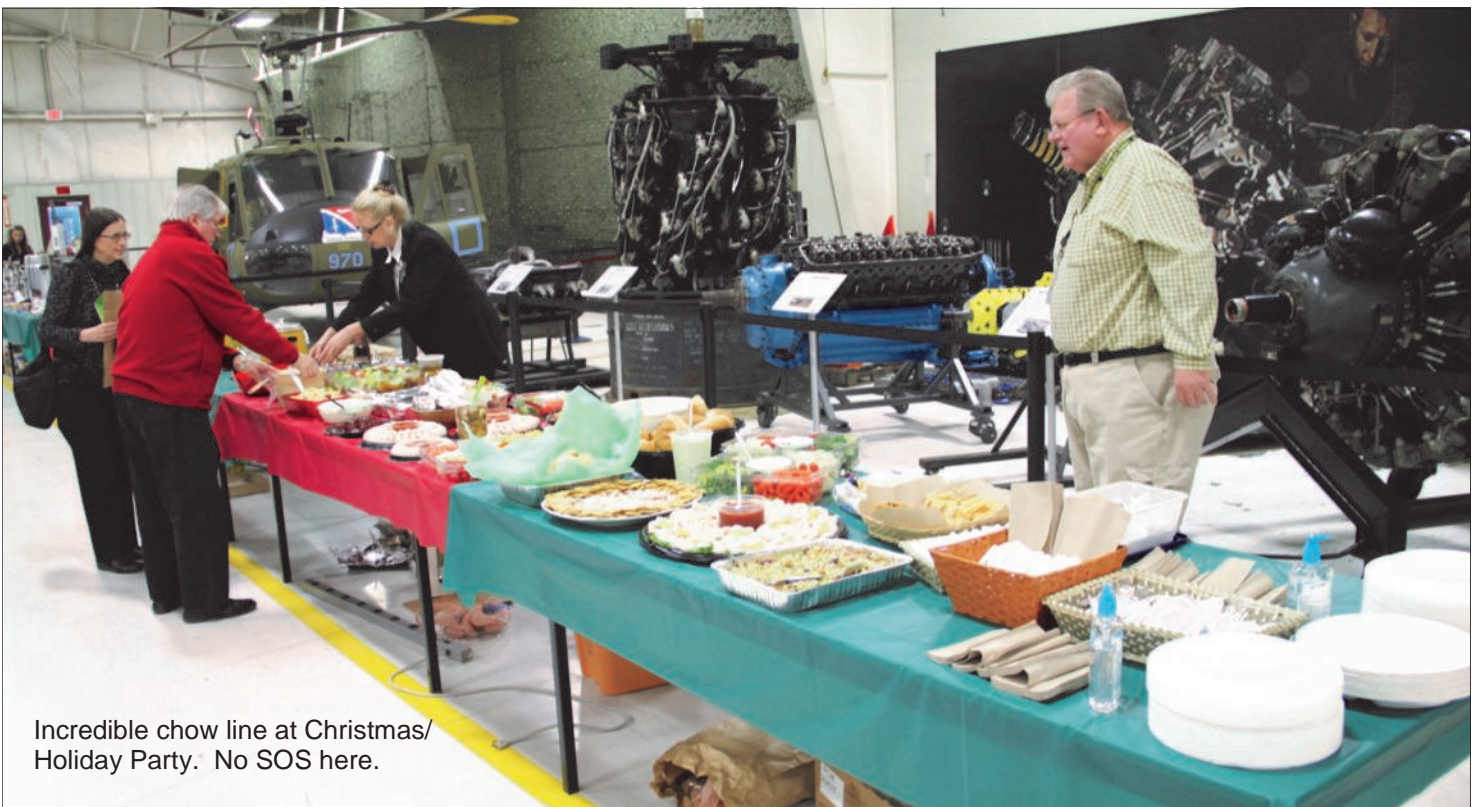
Incredible chow line at Christmas/Holiday Party. No SOS here.

Santa wished everyone a Merry Christmas and reminded everyone to remember those serving in the armed forces this holiday season, and all year round.